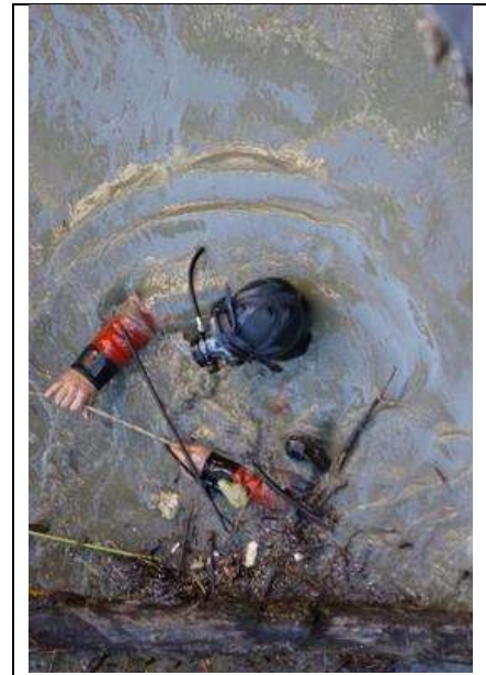
Renoglio tries to bring the top of the sub in trouble

The Tiber, between uprooted trees and mud can still be seen of the jetty pylons and some overturned boats. "Other boats were away by water flow - reported the holder Carlo Coccia Colaiuta - and have been wiped out facilities for at least 150 million pounds of old. Much worse, however, went to the storage of boats" River "that is just in front of us, on the other side. they came away at least 20 meters of the shore and the water took away boats, caravans, tents and campers. it 'also disappeared along the jetty where they kept many boats. But throughout the area the damage was considerable. "