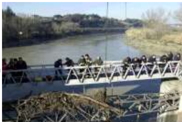
La diga a Castel Giubileo

ROME - "In less than an hour it came down all over. The river level has dropped and both sides without water pressure that supported them, have collapsed, from Labaro until at least the Grillo" Bridge. So the inhabitants of the area upstream of the Castel Giubileo dam told the consequences of lowering waters of the Tiber, when to free the sub got stuck in the waters of the reservoir, the locks of the dam were opened. In the rescue operation he has killed a firefighter.