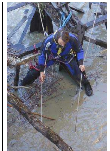
The colleague has noticed that Renoglio no signs of life and pulls the top to find it

Maybe a blow or debris that they took the mask with oxygen the cause of the fatal 14 January 2003