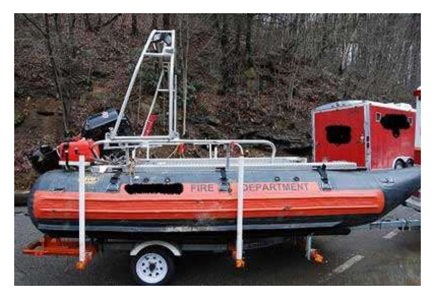
Rescue boat involved in incident.