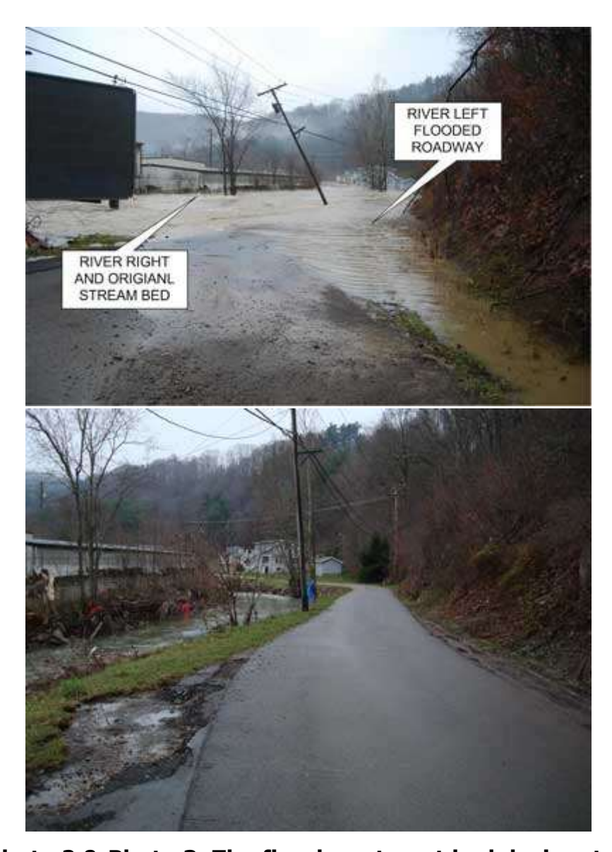
Photo 2 & Photo 3. The fire department had designated river-right and river-left from the downstream perspective. Both photos show view looking upstream at insertion point for rescue crews. Photo 3 was taken two weeks after incident. Houses in the background are where the residents were trapped.