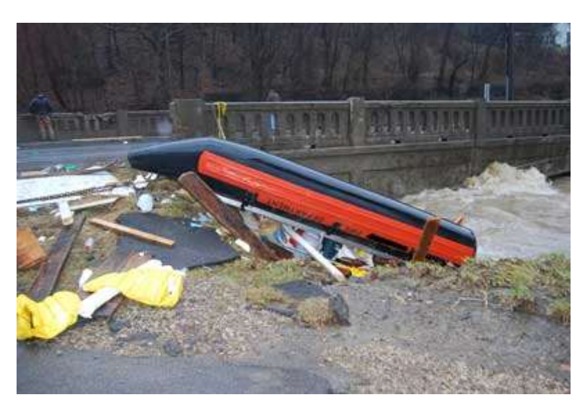
Position of rescue boat when initially pulled from river.