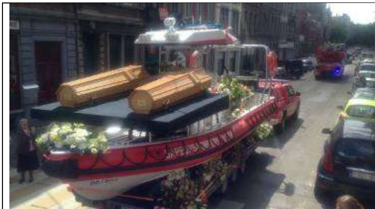
Liège: a lot of emotion at the funeral of the deceased firefighters in Tilff (1)

https://translate.google.com/translate?hl=en&sl=fr&u=https://www.rtbf.be/info/regions/detail_liege-beaucoup-d-emotion-aux-funerailles-des-pompiers-decedes-a-tilff%3Fid%3D8268566&prev=search