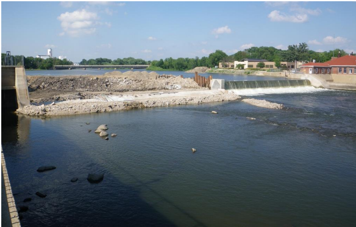
Photo above during reconstruction on 7/30/2011