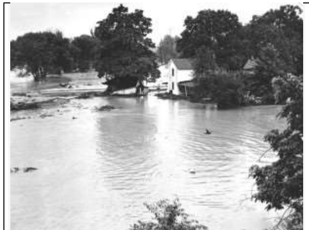
Smashed buildings show the damage caused by flood water from the Little Apple Creek that swamped the area around Bauer Rd. in Wooster, OH.