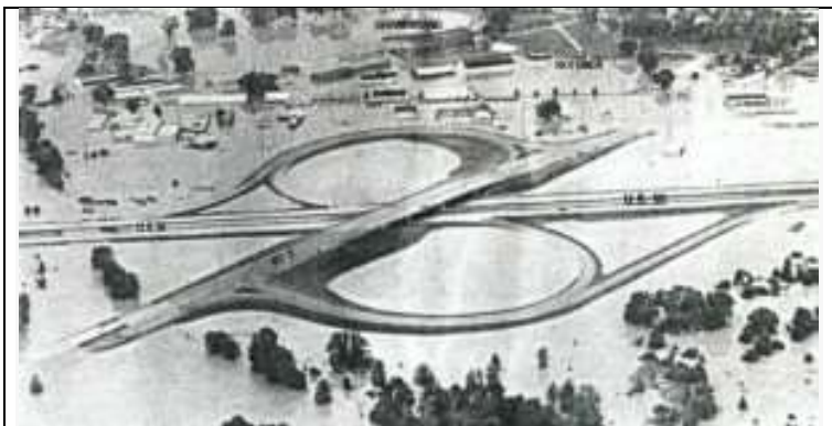
The area of the Wayne County fairgrounds was nearly completely flooded during the July 4th 1969 flood.