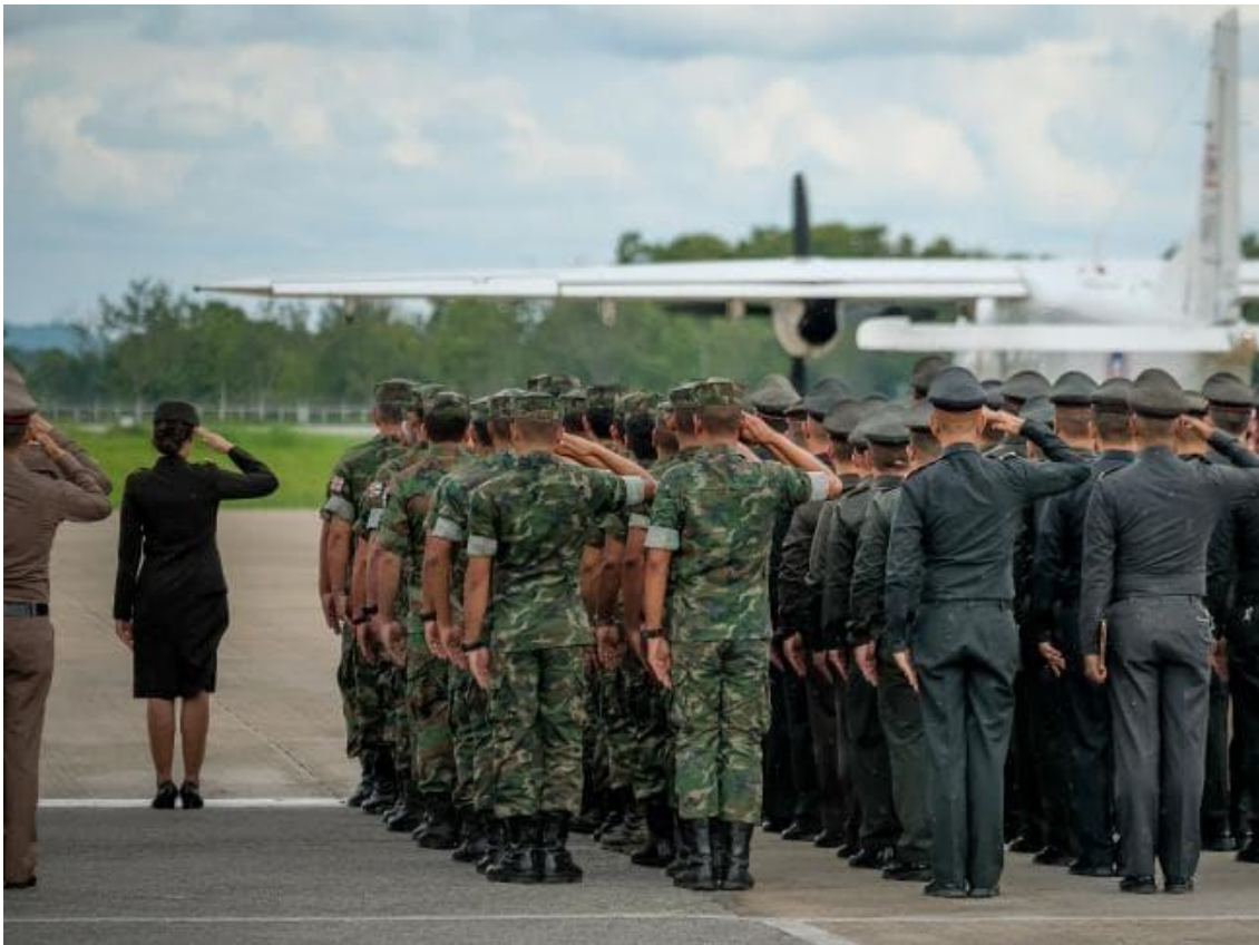
Members of the armed forces stand a salute as Mr Gunan’s body is flown back to his home town.