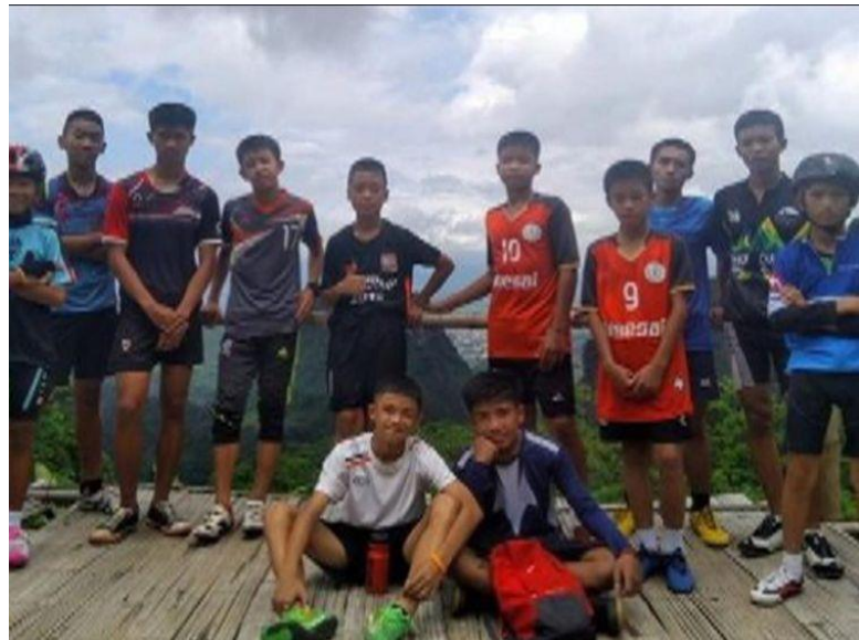
Rescuers are racing against time to rescue the boys and their coach

The Thai Navy Seals are in charge of extraction plans, with the help of dive teams from Britain, America, Australia and Asia.