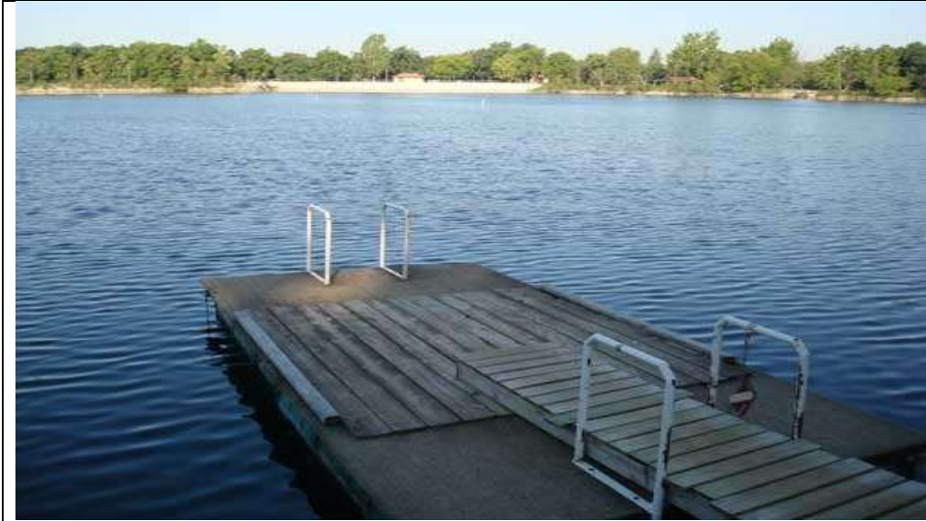
Dock where victim was pulled from quarry.