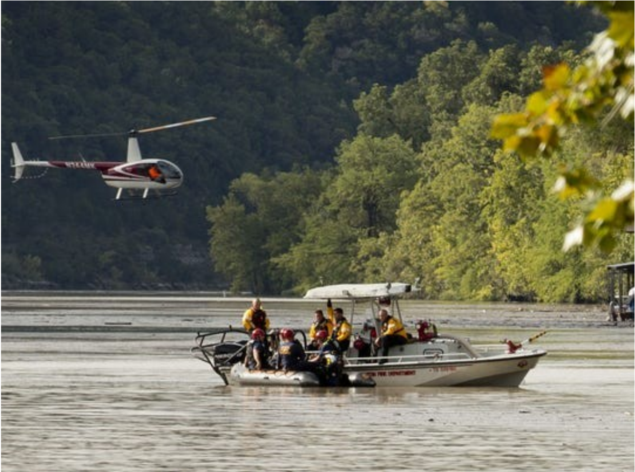
Austin firefighters in boats and Travis County Sheriff deputies in a helicopter search Lake Austin for a missing Travis County Sheriff deputy who was swept away in a flood Sept. 18, 2014, near Fritz Hughes Park in Austin, Texas.

The Travis County Sheriff's Office said the deputy reported around 1:52 a.m. CT Thursday that her car was being swept away on Fritz Hughes Park Road at Bear Creek near the Colorado River.